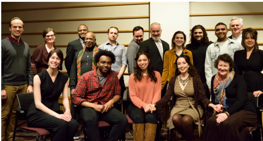
Cast and crew of Romeo and Juliet (February 2020)

We are blessed today to see each of you again in your seats here at the Newberry after our “sad interim.” Thank you for your patience and loyalty.