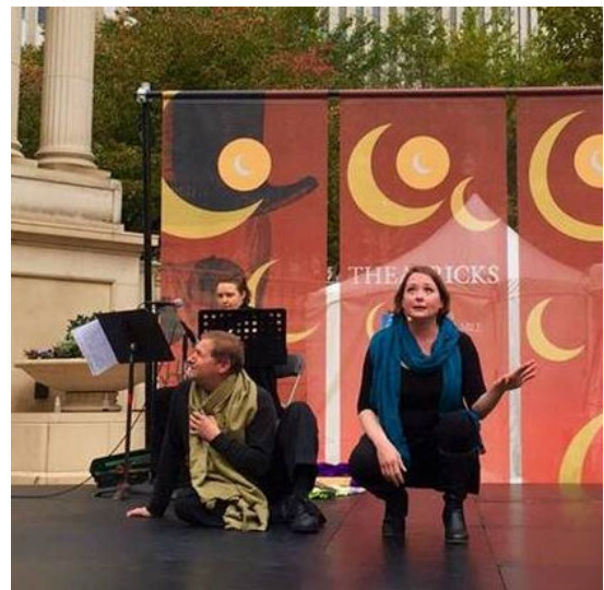
“Spooky Shakes” was presented in Millennium Park.