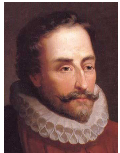
Don Miguel de Cervantes (pictured) and William Shakespeare died on the same day: April 23, 1616.